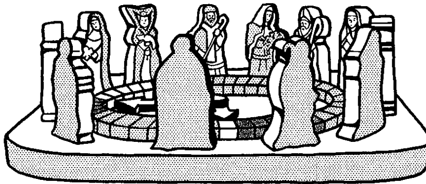
COMPLETE LAYOUT OF THE COMMUNION OF SAINTS

They all prayed and came close to God. And they all did amazing things.